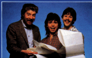
Adapted by Beck-Tech.